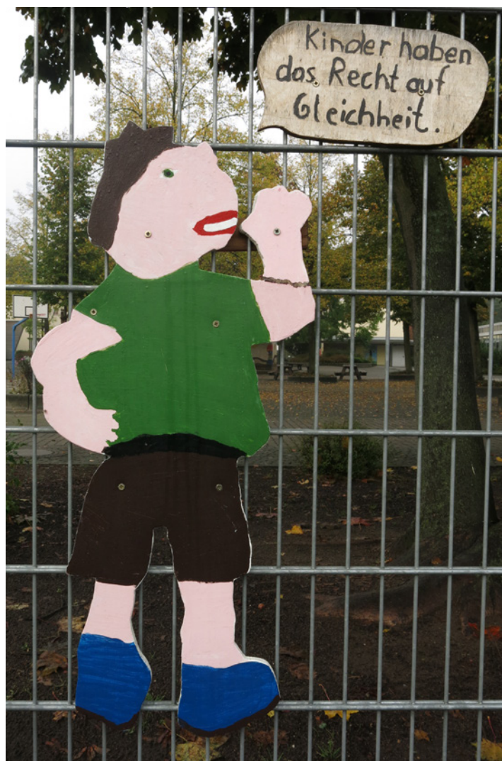
'Children have the right to equality', Albert-Schweitzer-Schule, Germany

Respondents were largely sceptical about the barriers to implementing human rights education, including lack of support for the CRC and a more general traditional of American 'exceptionalism'.